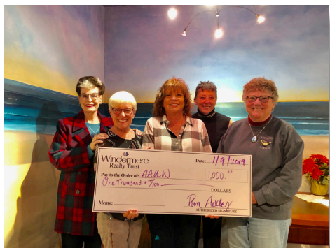
Windermere Foundation awards a gift.