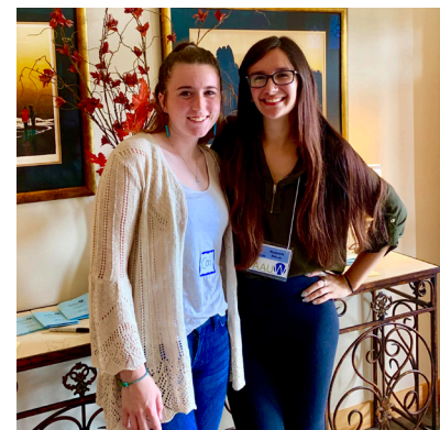
Happy scholarship recipients